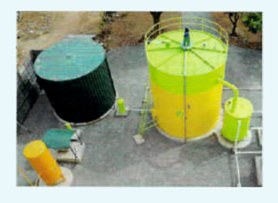
CSTR-Fixed Dome 1 TPD food waste Bio gas Plant for cooking