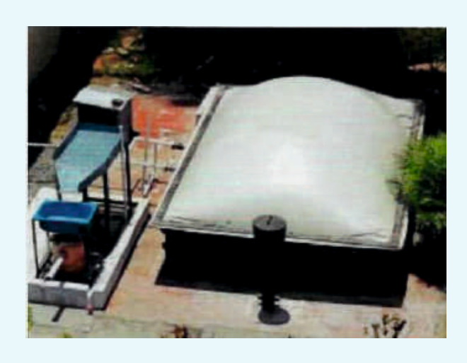
Geo Membrane type 100 KPD food waste bio gas for cooking